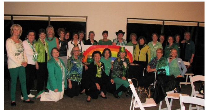
The Gang WAS all there