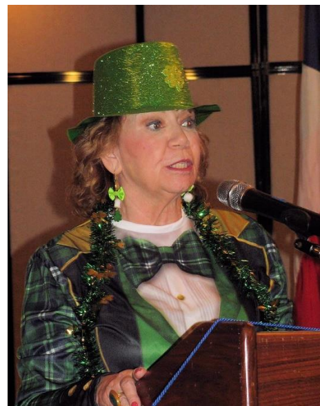
Our favorite leprechaun