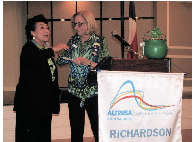
Looks like St. Patrick's Day