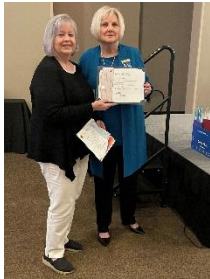
Mamie L. Bass Service Award