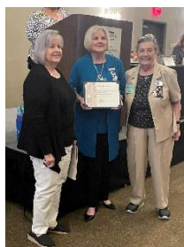
Dr. Nina Fay Calhoun International Relations Award