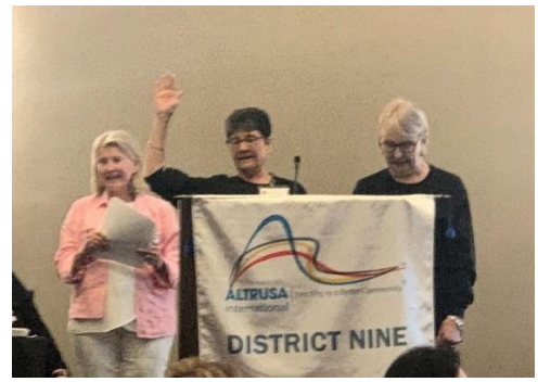
Governor Shirley Raymer observes as letters are chosen