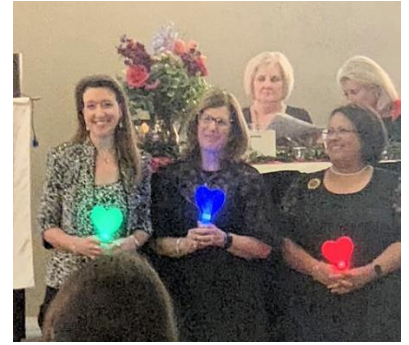
Our own future Governor, Kimberly Kierce, whose candidacy for Governor-Elect was announced.