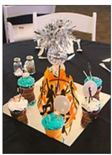
Disco Ball centerpieces