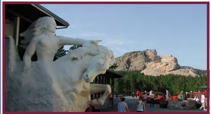
ENORMOUS CARVING OF CHIEF CRAZY HORSE IN BACKGROUND WITH SCALE MODEL IN FOREGROUND.

So if you think going to Convention is boring—you might want to reconsider. It’s time to be planning for 2013 in NEW ZEALAND! If it seems like it was fun in Rapid City just think what a Really Good Time that will be!!!